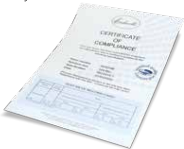
Certificate of Compliance Supplied with every test sieve

Endecotts test sieves are of the highest quality and are designed for accurate and efficient particle analysis.